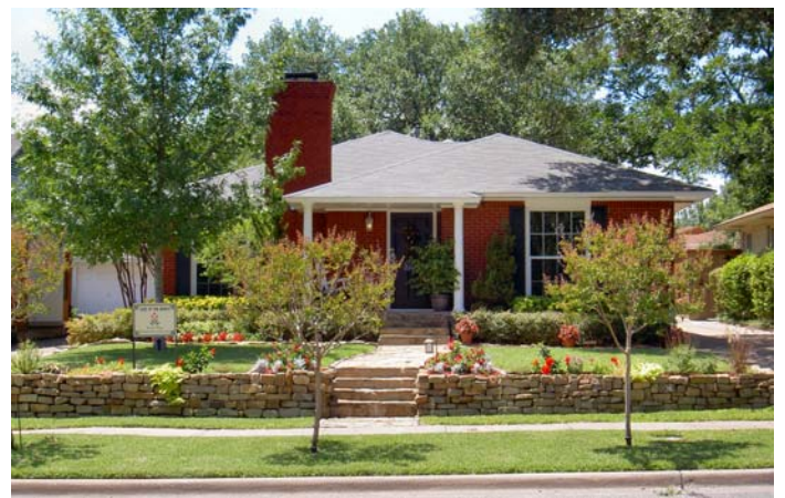
The home at 2618 W. Tenth St. was selected as Kessler Plaza's Yard of the Month for June 2006.