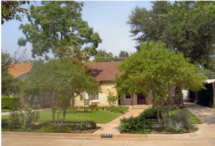
The home at 2507 Marvin Ave. was selected as Kessler Plaza's Yard of the Month for September 2006.