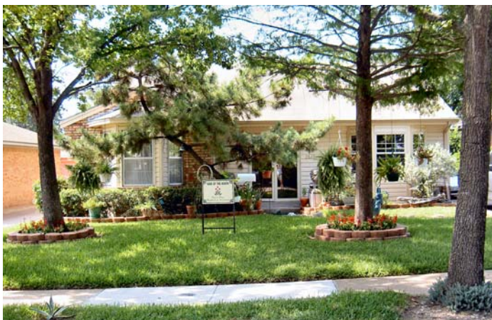
The home at 2638 Alden Ave. was selected as Kessler Plaza's Yard of the Month for July 2006.