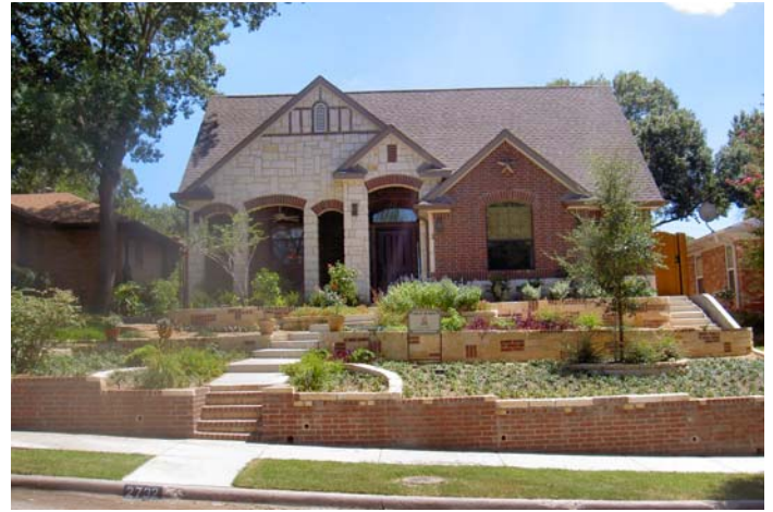
The home at 2732 Alco Ave. was selected as Kessler Plaza's Yard of the Month for August 2006.